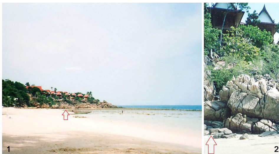
Figs. 1–2: Type locality of Laius zappii sp.n.: (1) overview from Yao beach, viewed from the east; (2) detail of the habitat.

Colouration: Head capsule, pronotum and elytra black with azure bluish hue; last maxillary palpomere, antennomeres IV–XI, pro- and mid-femora, and hind legs black; basal two maxillary palpomeres and antennomeres I–III orange-red; antennal sockets, pro- and mid-tibiae and pro- and mid-tarsi in part brownish brightened.