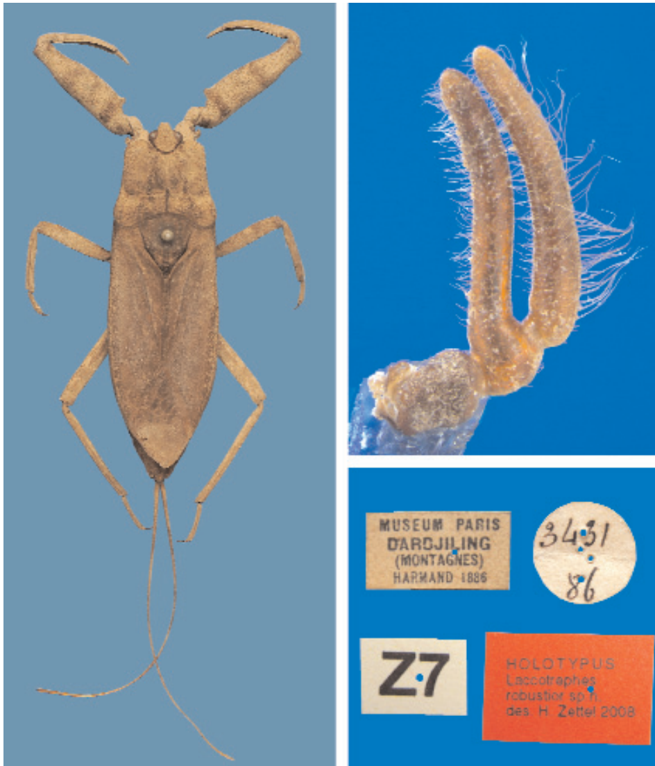
Figs. 1 - 3: Laccotrephes robustior sp.n., male holotype. (1) Habitus, dorsal aspect (body length 44.4 mm); (2) antenna (maximum length of second antennomere 1.79 mm); (3) labels.

Colour (Fig. 1): Light to dark brown. Eyes blackish brown. Dorsum of abdomen below wings light red (except apex blackish). Legs light brown; femora and protibia with indistinct dark annulation.