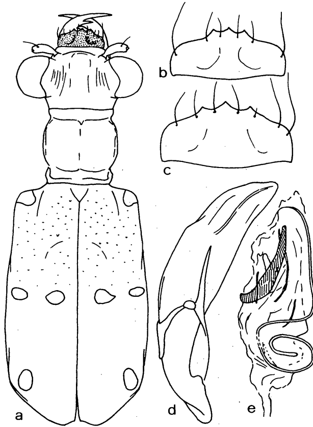
Fig. 3. Probstia (gen. n.) triumphalis (W. HORN, 1902). a: habitus, b: labrum (syntype male specimen from "Montes Mauson, Tonkin"; DEI); c: labrum (female syntype from same locality; DEI); d: aedeagus (male specimen from Lienping, Kuantung, China; DEI); e: inner sac of aedeagus (male specimen from Than-Moi, Tonkin, Vietnam; FCC).

These puzzling characters are completed by a fusiform tapering male aedeagus, slightly widened in the middle, with a short blunt apex and a fine carina on the left side only, from the apex to nearly one third of the total length. The inner sac of the aedeagus includes a large arciform sclerite and a long narrow flagellum which describes a complete convolution on the left side, then passes to the ventral side by defining a membranous plica that outlines a kind of "mantle" (RIVALIER, 1950), similar to that of species of the Oriental genus Calochroa HOPE (RIVALIER, 1961): However, while the shape and position of the flagellum would rather recall those of the genus Cylindera WESTWOOD, there is not the sclerite, so characteristic of the genus Cylindera , that RIVALIER (1950) had called "équerre", but a thin, small, elongate, almost straight sclerification visible under the upper convolution of flagellum which apparently can not be associated with the "équerre".