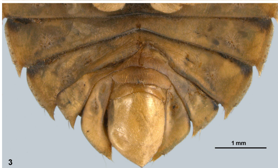
Figs 2–3. Aphelocheirus winkleri sp.n. (2) Venter of a brachypterous male; cutout illustrating tip of rostrum (ro), propleural process (pplp), and mesosternum (mst), slightly oblique view perpendicular to left prosternal process (in picture on right side). (3) Abdominal venter of male.

strongly transverse, 4.41 times as broad as median length, without demarcated lateral areas; hind margin laterally almost straight. Propleuron mesally with an acuminate process (Fig. 2). Mesoscutellum 2.5 times as broad as long. Elevation of mesosternum (Fig. 2) anteriorly with blunt median carina, posteriorly tumescent, in lateral aspect its outline only slightly convex, its apex slightly protruded posteriorly.