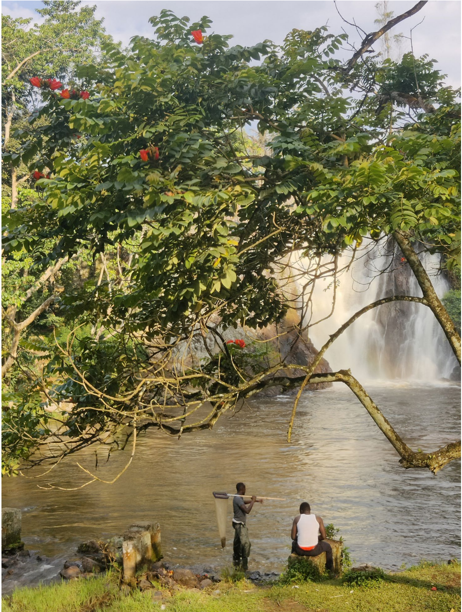
Fig. 10. Type locality at Ssezibwa River.