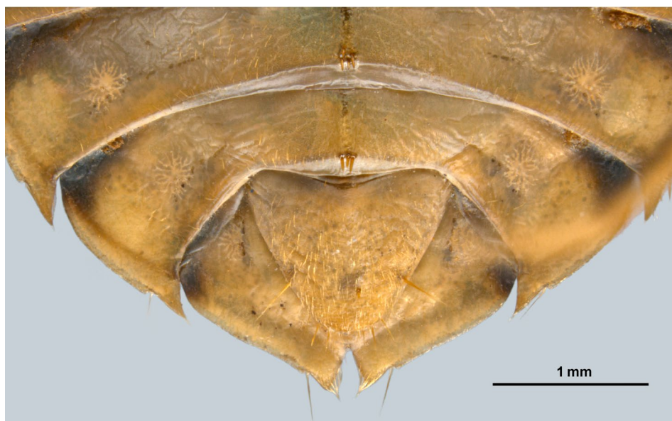
Fig. 9. Aphelocheirus winkleri sp.n., abdominal venter of female.