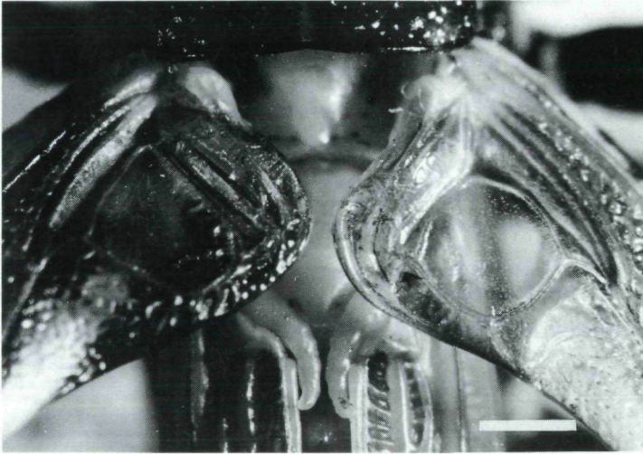
Fig. 1. Tubes at the articulation of the alae in male M. siamensis (scale bar = 2 mm).

turned at a height of approximately 3 m, perhaps as a consequence of too-high light intensity, and were collected immediately afterwards. A comparison of larval and adult abundance is not yet possible, because a quantitative analysis of the imagines in the canopy would require a much greater technical effort (e. g. PERRY 1978, STORK 1991) than merely the use of halogen lights.