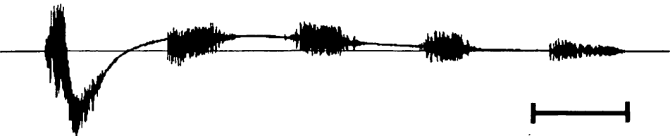
Fig. 3. Oscillogram of the calling song of M. siamensis (scale bar = 20 msec.).

vary between 3 seconds and about 5 minutes. One verse lasts on the average 160 msec. (117-213 msec.) and consists mainly of 5 syllables; occasionally, six syllables are produced. The mean durations of the syllables are: 14 msec. (first), 15 msec. (second), 15 msec. (third), 15 msec. (fourth), 17 msec. (fifth) (Fig. 3).