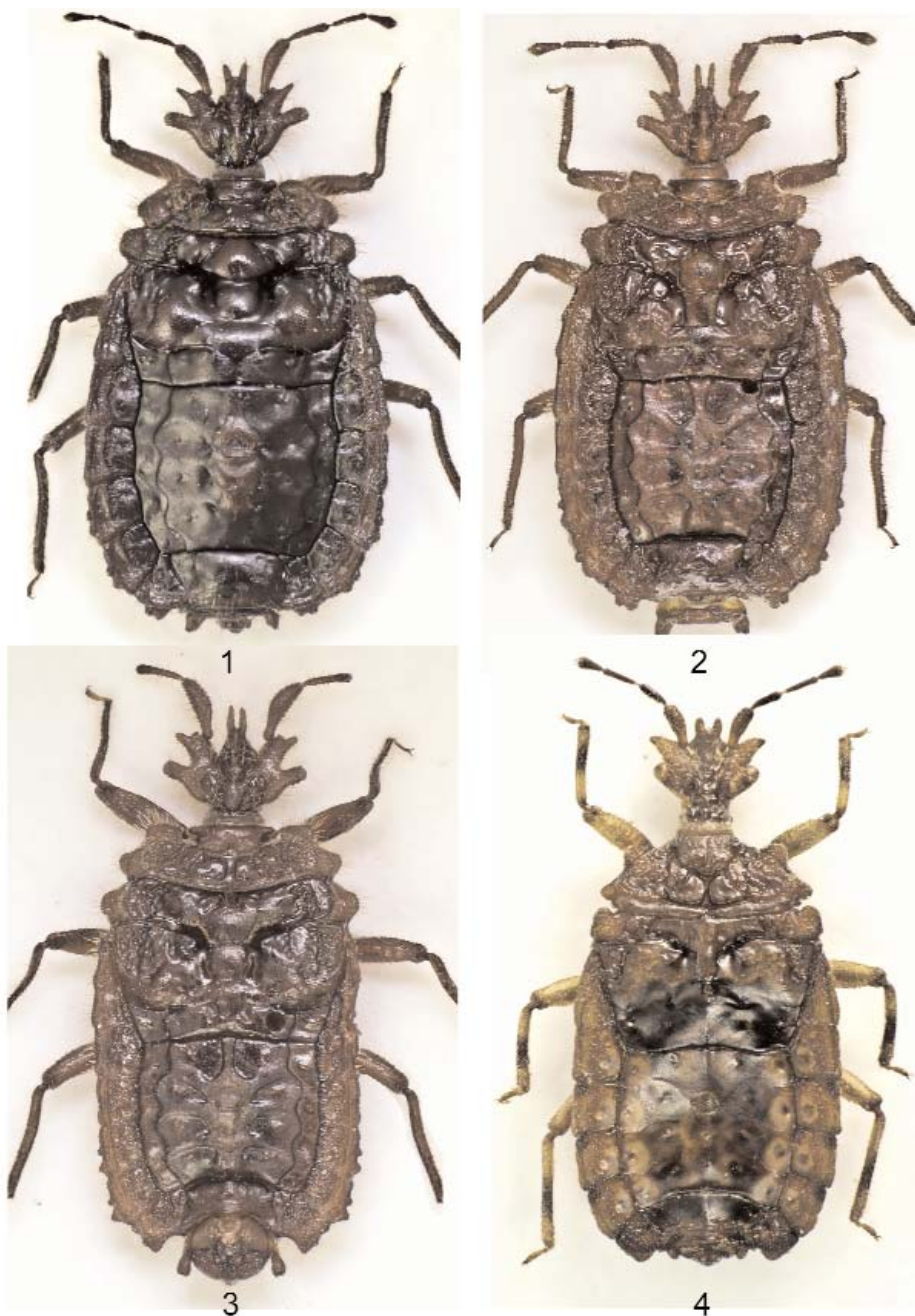
Photos 1 - 4: (1) Kaulocoris stylatus , female; (2) Kaulocoris monteithi sp.n., female paratype; (3) Kaulocoris monteithi sp.n., male holotype; (4) Noumeaptera spinicephala gen.n. et sp.n., male holotype.