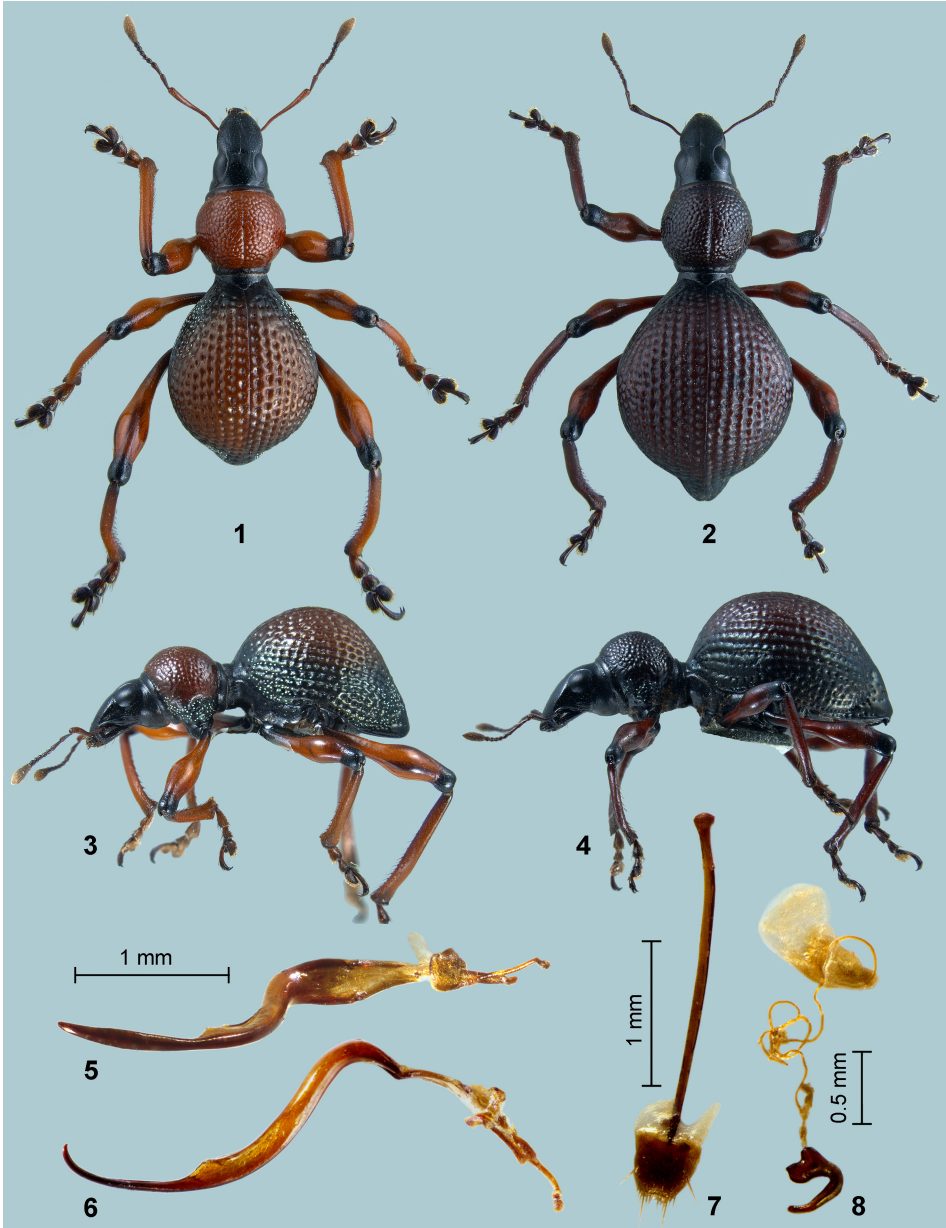
Figs. 1 - 8: (1 - 4) Habitus of (1, 3) male and (2, 4) female paratypes of Pseudapocyrtes legorskyi sp.n., in dorsal and lateral view. Note that colour is not sex-specific. (5, 6) Aedeagus of P. legorskyi sp.n., lateral view in two different aspects. (7) Sternite VIII, ventral view. (8) Spermatheca with associated ductus.