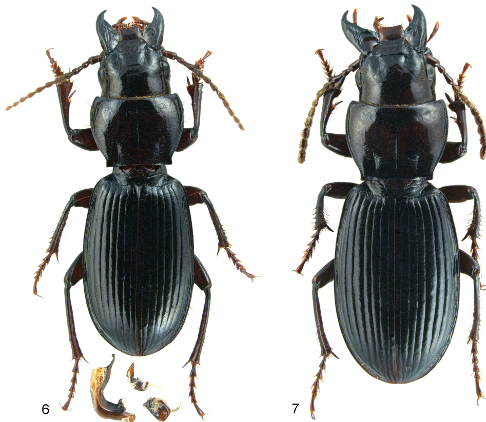
Figs. 6 - 7: Habitus of Tapinopterus (Molopsis) lohaji sp.n.: (6) male holotype; (7) female paratype.

Description: Body black; antennae, mandibles, tibiae, and tarsi hardly contrasting to body; length measured from apex of mandibles to the apex of elytra 11 - 13.5 mm. Habitus typical for Molopsis , body rather flattened, as in Figures 6 and 7.