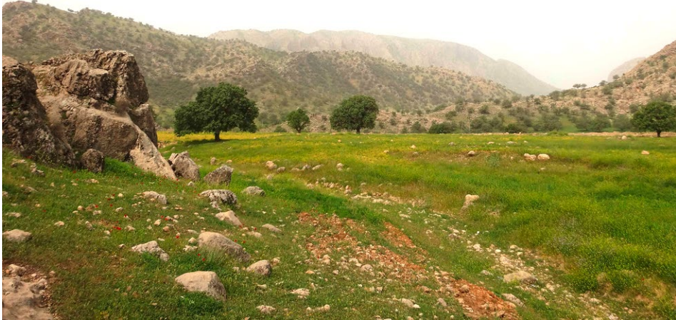
Fig. 1: Yasuj province, oak forest (30°16'56"N, 50°35'27" E), 12.IV.2015.

Explorations in southwestern Iran yielded the discovery of an unknown species of Olisthopus . First studies showed that it is morphologically different from O. elburzensis . Further studies to clear its position, including comparison with Iranian, Turkish and other West Palearctic species, revealed that this species is new to science.