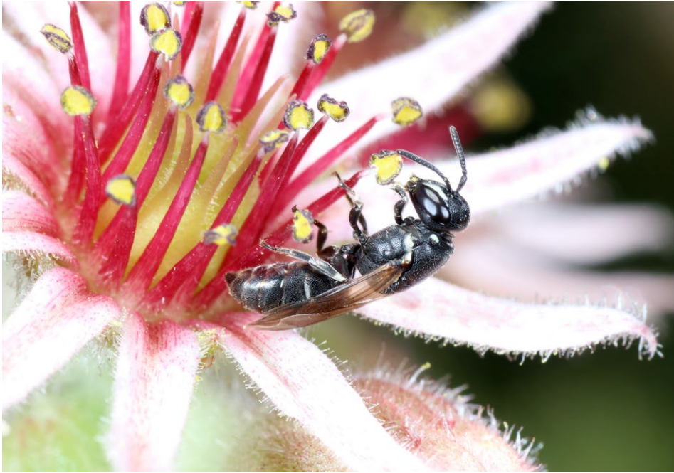
Fig. 1: A female of H. punctulatissimus collecting pollen on Sempervivum sp.

To confirm the observations, a pollen analysis was carried out by the first author. For this approach, the metasoma of the pin-mounted specimen was cut off and dissected to remove the pollen from the crop. The pollen was placed on an object slide together with glycerin gelatin and fuchsin dye. The pollen preparation was studied under a light microscope. After pollen identification with help of PalDat (Palynological Database) and literature (BEUG 2004, HESSE et al. 2009), percentages of each pollen type were calculated by counting pollen grains.