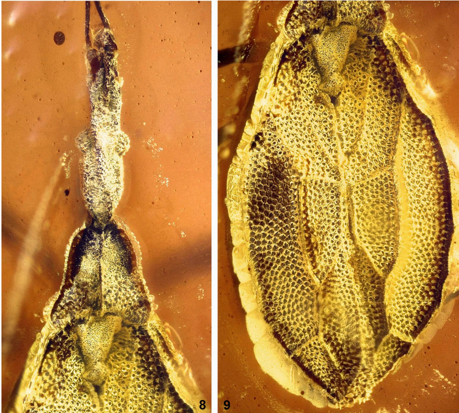
Figs. 8–9: Tingiometra burmanica sp.n. (holotype): (8) head, pronotum and scutellum; (9) hemelytral structure, dorsal view.

Etymology: The epithet refers to the country of origin of the amber inclusions.