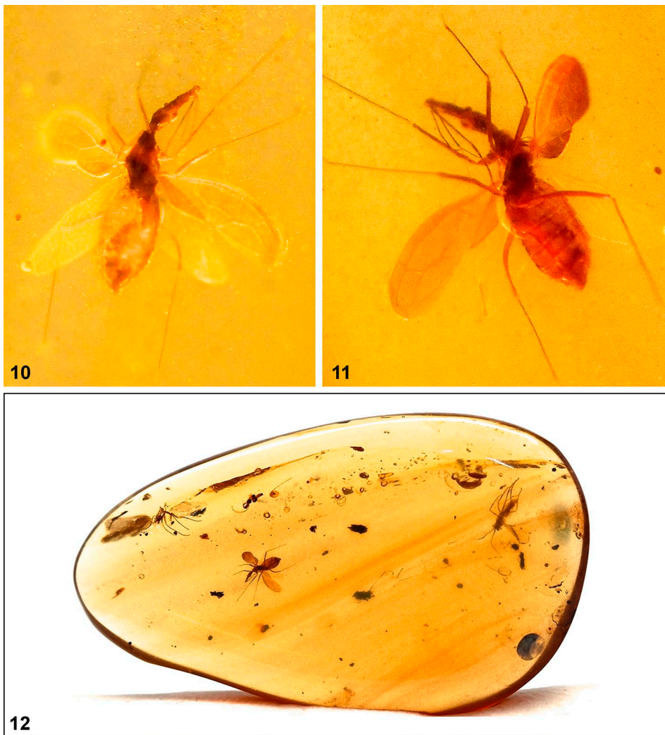
Figs. 10–12: Tingiometra burmanica sp.n. (paratype): (10) dorsal view; (11) ventral view; (12) amber piece with paratype and syninclusions.

absence of tubercles or spines on head, elevated crest-like clypeus, concave posterior margin of pronotum (except Eocader DRAKE & HAMBLETON, 1934), large scutellum, the dichotomy of vein R+M in its distal part and the very long hind legs, their femora nearly reaching apex of abdomen. In extant Tingidae antennal segment III is the longest, head is usually beset with spines or tubercles, clypeus is not elevated above frons, and R+M is not bifurcated at apex. These complex features mentioned above indicate that this proposed new subfamily represents another fossil tingoid link (like the Cretaceous Ignotingidae ZHANG et al., 2005) within their phylogeny and is most probably the ancestral group of one of the basic extant cantacaderid groups of Tingioidea.