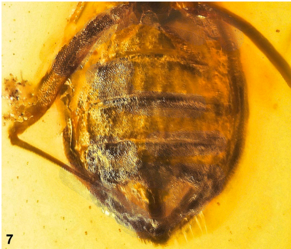
Figs. 4–7: Tingiometra burmanica sp.n. (holotype): (4) dorsal view; (5) lateral view; (6) ventral view; (7) terminal ventral segments.

plate of segment VII (DRAKE & DAVIS 1960). Details of ventral apex are not discernible in the holotype.