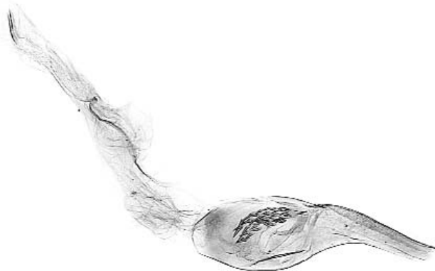
Fig. 4: Monochroa inflexella male genitalia, phallus.

habitat in Italy is alpine grassland with diverse vegetation on limestone surface, interrupted by alpine scree and rock-formation.