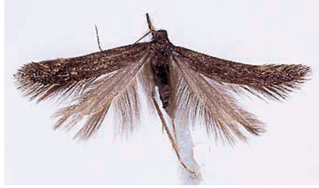
Fig. 1: Monochroa sperata sp. n., adult, paratype.