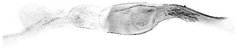
Fig. 3: Monochroa sperata sp. n., male genitalia, phallus, holotype.

southern Ural Mountains (Junnilainen et al. 2010). We can here also record it as new to France: 2 ♂♂, Hautes-Alpes, Reotier, 1000 m, 22.vi.1990, leg. A. Cox (coll. Cox and ZMUC), and from Hungary: 1 ♂, 6 km N Keszthely, 30.vi.-7.vii.1999, leg. B. S. Larsen (ZMUC).