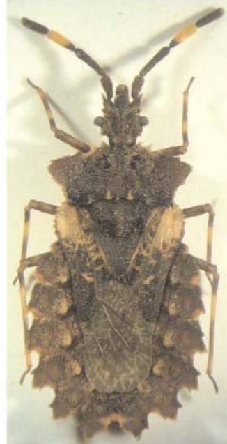
Photo 1-4. 1 - Aradus formosanus n.sp, male; 2 – ditto female; 3 - Miraradus angulatus n.sp., male; 4 – ditto female.